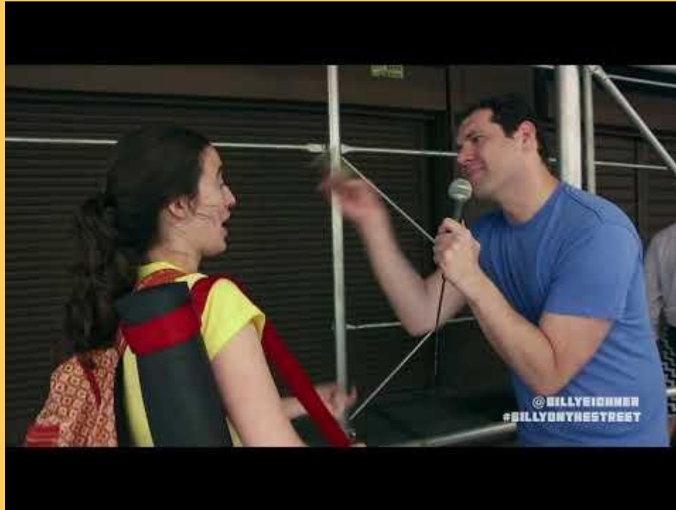
The inspiration: Billy on the Street